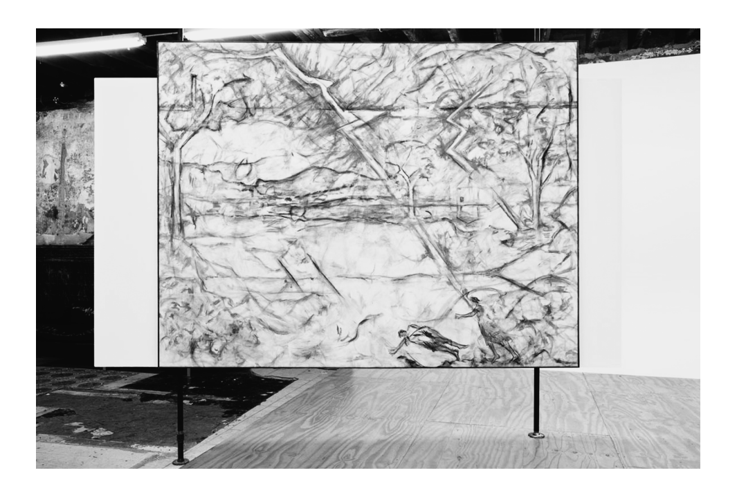
Jutta Koether. Hot Rod (after Poussin). 2009.

Reena Spaulings Gallery in New York, for instance, painting functioned as a cynosure of performance, installation, and painted canvas. The exhibition centered on a single work mounted on an angled floating wall—much like a screen—which, as Koether put it, had one foot on and one foot off the raised platform that delineates the gallery's exhibition area, as though caught in the act of stepping onstage.<sup>2</sup> This effect was enhanced by a vintage scoop light trained on the painting that had been salvaged from The Saint, a famous gay nightclub that officially closed in 1988 largely as a consequence of the AIDS crisis. The canvas itself, Hot Rod (after Poussin) (2009), is a nearly monochromatic reworking of Poussin's Landscape with Pyramus and Thisbe (1651), representing a Roman myth centered on the extinction of love—and life—caused by the misreading of visual cues (Pyramus sees Thisbe's ruined veil and assumes she has been murdered by a lioness, leading to his suicide, and then, upon finding him dead, Thisbe's own). The painting is predominantly red—the color of blood and anger (and by extension AIDS)—and it centers on a scaled-up motif—a giant bolt of lightning that