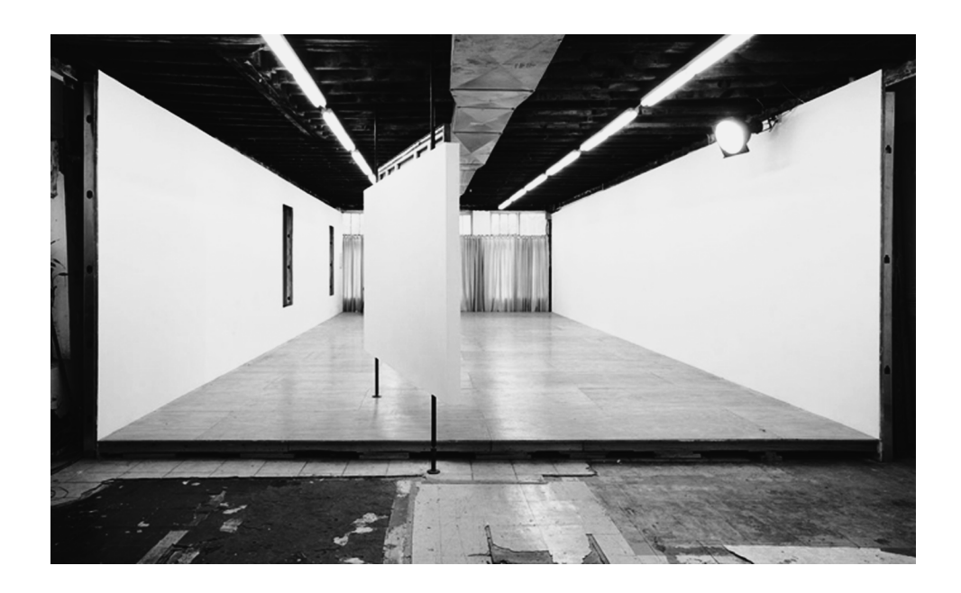
Koether. Lux Interior. 2009. Installation view, Reena Spaulings Fine Art, 2009.

had played a much less prominent role in Poussin's canvas. This jagged form divides the composition like a scar, around which brushstrokes coagulate. The marks are by turns tentative and assertive, something like a caress before a slap. Indeed, inspired by T. J. Clark's extended reading of Poussin in The Sight of Death (2006), Koether develops a gesture that is deeply ambivalent: equally composed of self-assertion and interpretation, her strokes are depleted of expressive urgency by marking the elapsed time between Poussin's 1651 and her 2009.<sup>3</sup> Three lecture performances accompanied the exhibition in which Koether moved around and even under the wall that supported her canvas—her body and the bright anger of her recitation of collaged text furnished a frame for the canvas. The painting's own presence as a personage—or interlocutor—was further enhanced by strobe lights flashing onto it in different configurations during these live events as if painting and painter had encountered one another in a club.<sup>4</sup>